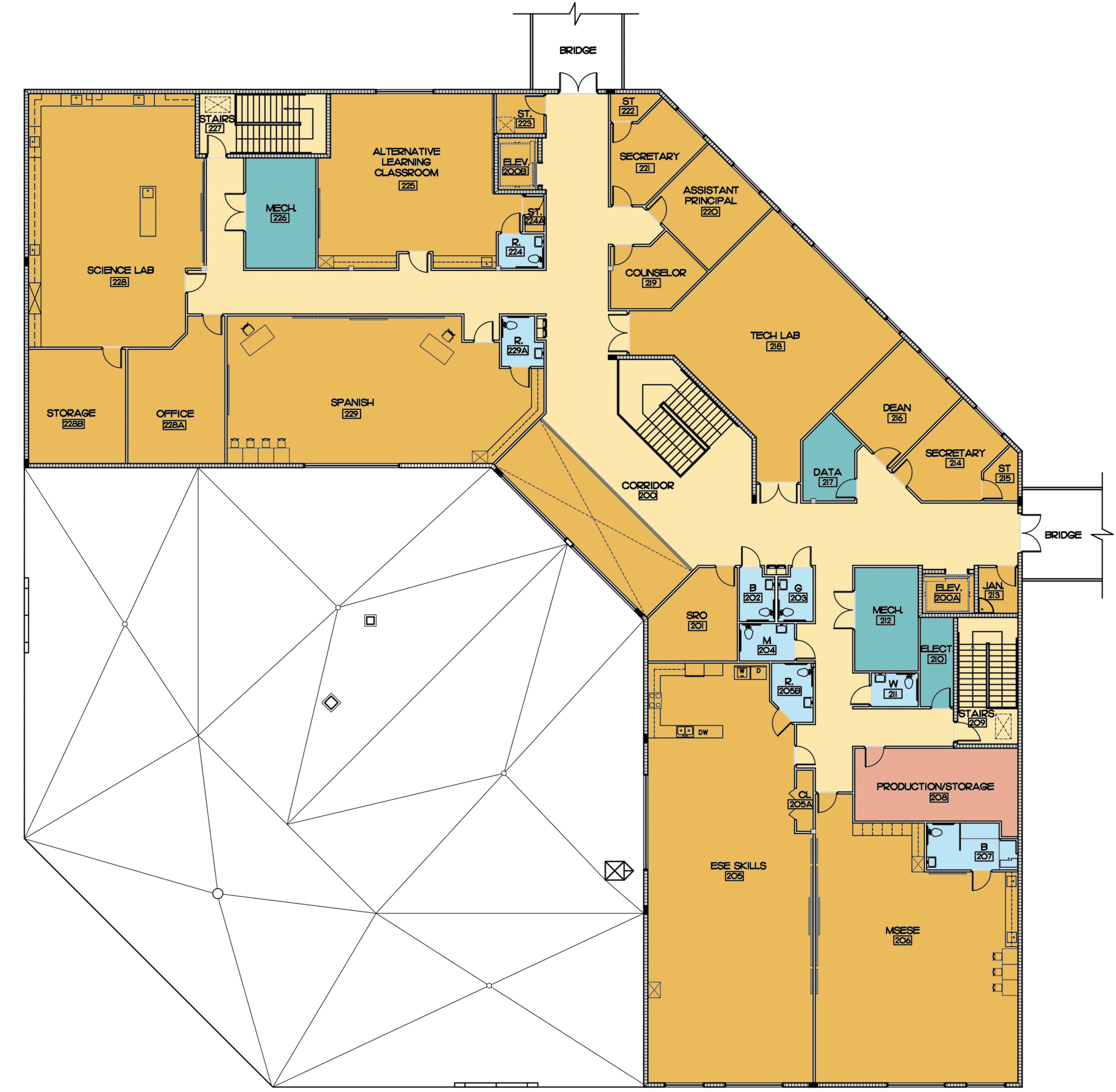
K-8 SCHOOL ADMINISTRATION BLDG I - 1ST FLOOR SCALE: 1/16" = 1'-0" 23,066 S.F. (PROPOSED)