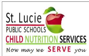
Front of the Shirt

Color of the Tee-Shirt will change from year to year. Approximately 75.