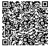
Beanstack in Google Play

Install " Beanstack Tracker " on your phone or tablet, search for "st. lucie" and sign up to track your reading digitally.